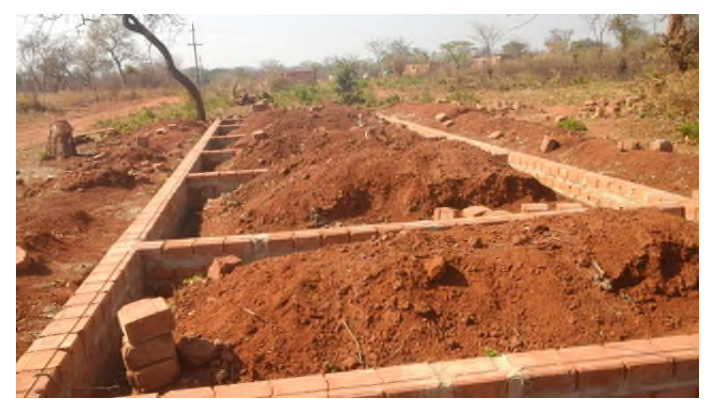
Foundation for two married student houses

We have, however, temporarily suspended operations at the <u>Bible College</u> (for about 3 months) as we don't yet have all the housing for the students completed. Although the new dorm is finished, we still need to build 4 married student houses as soon as possible. These are very simple houses (3 small rooms) and can be built in about two months. I have three construction crews ready to start work in about a month, but I only have money to build the walls (up to the roof). We need about $4,500 per house to finish this project.