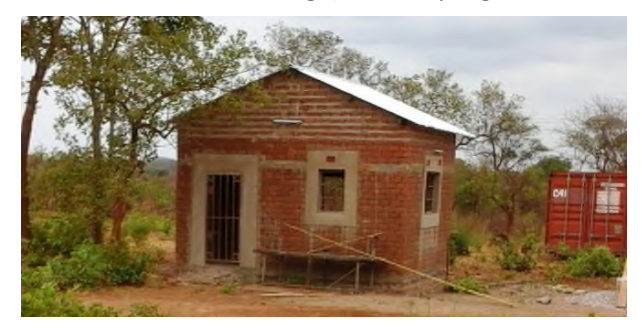
Administration Office (Stella's Office)

Projects Completed . We have already finished the electrical and plumbing infrastructure for the campus. We have three water wells and four 2800 gallon tanks up on 25 foot steal towers. In addition, we have completed the new classroom building, an office (financial office), 5 staff houses, a student dorm, and a house for Kerin (pictured on page one). We also have finished clearing 25 acres (ready for planting) and built a one mile road to our campus (which included a small bridge). Lot of progress!