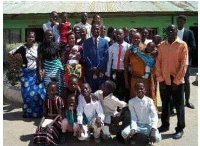
New Church Planting

Finally, another windstorm (without any rain) blew off the roof to our large chicken house. I thought we had reinforced our roofs after the last windstorm did this; but apparently not. Our chicken houses are vulnerable because of the large openings on the side (chicken wire without side walls).